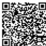
How to complete your ethics self-assessment

The process to assess and address the ethical dimension of activities funded under Horizon 2020 is called the Ethics Appraisal Procedure and it consists of: